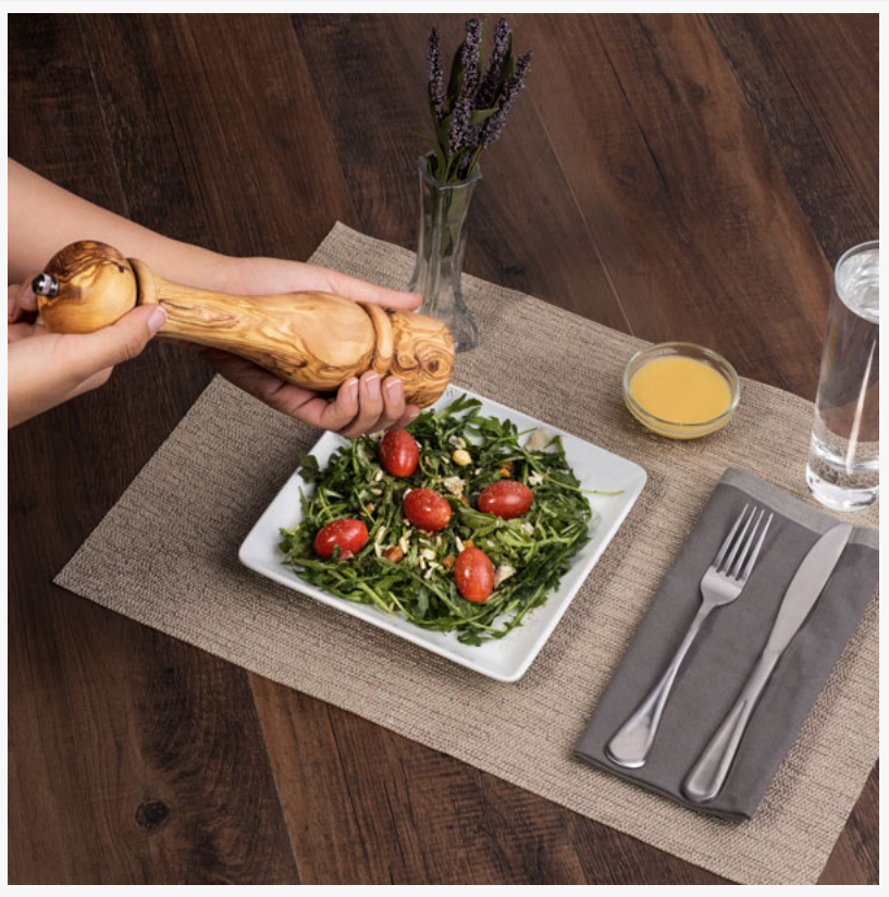
Olive Wood Pepper Grinder Over Salad

Sheila May Gourmet Living +1 203-629-1530 email us here