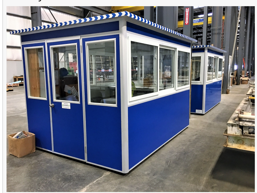
All Purpose Guard Booth

This press release can be viewed online at: http://www.einpresswire.com