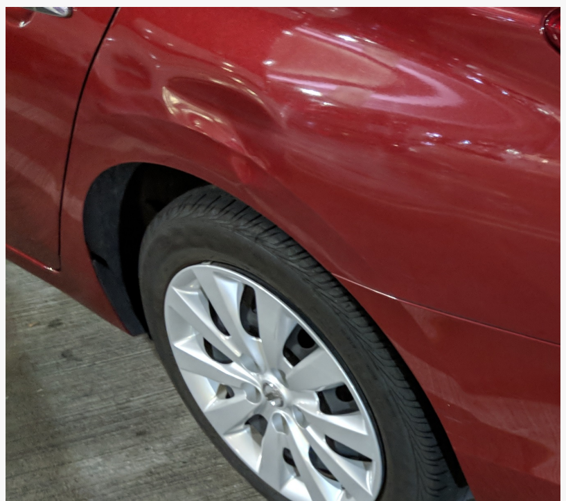
Assigned rental with undocumented and pre-existing vehicle damage with the very real potential to harm a renter

ORLANDO AND FORT MYERS, FL, UNITED STATES OF AMERICA, August 20, 2018 /EINPresswire.com/ -- SubscriberWise , the nation's largest issuing CRA for the communications industry and the leading protector of children victimized by identity fraud, announced today the public meeting demand from Enterprise Holdings 'ding and dent' felony grand theft crime victim to state and US lawmakers. The urgent meeting request follows a one-way rental from Orlando International Airport to the Fort Myers International Airport that exposes undocumented and pre-existing vehicle damage. It's a common type of pre-existing damage that is routinely used to implicate unsuspecting renters by predatory agencies seeking to exploit this unabated and dangerous consumer harm for significant financial gain.