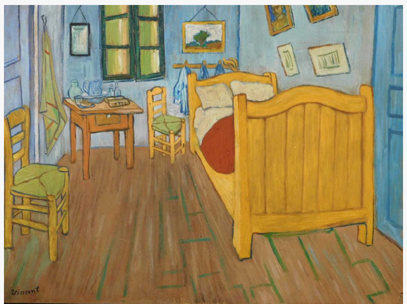
Gouache on board attributed to Vincent van Gogh (Dutch, 1853-1890), titled Bedroom at Arles (est. $100,000-$150,000)

The 237-lot Hidden Masterpieces Art Auction will be held live in Woodshed Art Auctions' 500 Gallery, at 475 Franklin Village Drive in Franklin, with a preview exhibition that will begin on Wednesday, August 29th. The color catalog can be viewed now at woodshedartauctions.com , as well as on the bidding platform LiveAuctioneers.com . People can register to bid on either site.