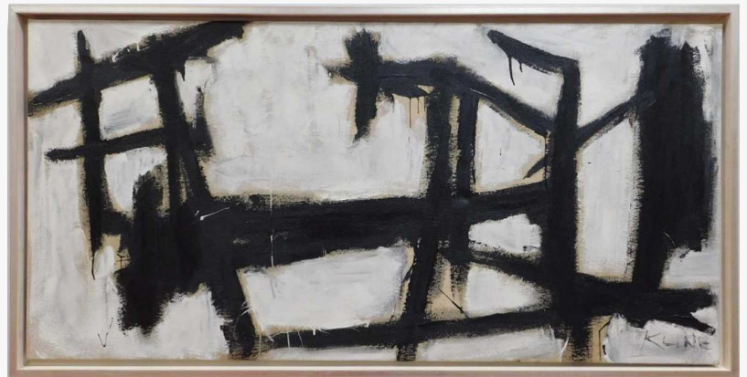
Oil on canvas abstract composition attributed to Franz Kline (Am., 1910-1962), framed (est. $150,000-$200,000)