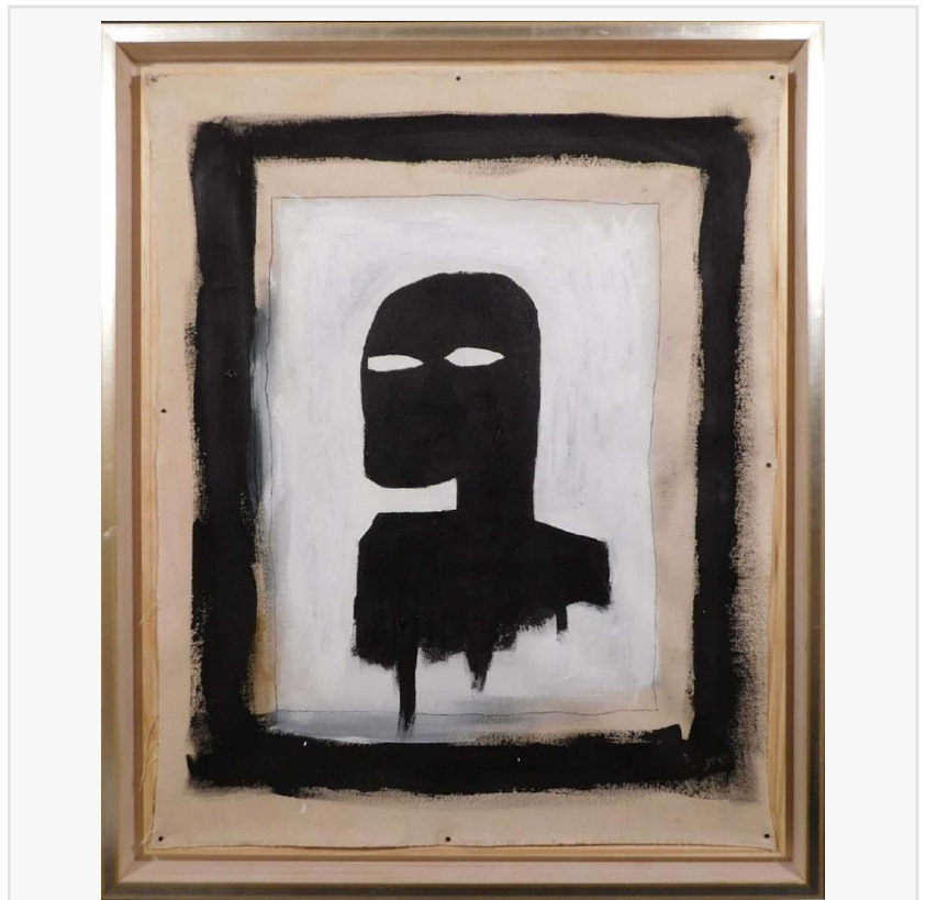
Acrylic on canvas portrait attributed to Jean-Michel Basquiat (Am., 1960-1988), titled Silhouette on Black and White Background (est. $75,000-$100,000)

For more information about Woodshed Art Auctions and the Hidden Masterpieces Art Auction scheduled for Thursday, September 6th, please visit www.woodshedartauctions.com .