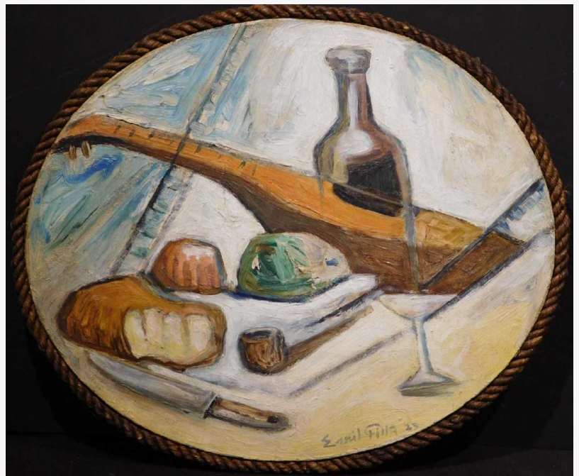
Oil on board attributed to Emil Filla (Czech., 1882-1953), titled Oval Still Life (est. $45,000-$60,000)