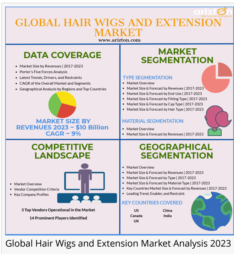
Global Hair Wigs and Extension Market Analysis 2023

Arizton's latest report on global hair wigs and extension market says that the market is driven by the rising interest for hair care products among men. The rapid urbanization and rising expendable livelihoods in rising economies such as India and China will boost sales in the global market. The market research report provides in-depth market analysis and segmental analysis of the global hair wigs and extension market by type, material, and geography.