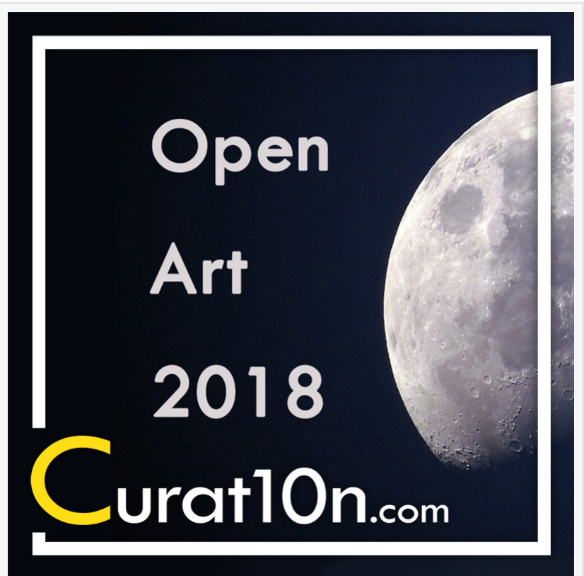
Open Art 2018 Moon Gallery

On 10th October Curat10n will reveal this interactive art exhibition for the first time - and give their audience a chance to explore it hands-on. There will also be opportunities for artists to take the idea further and to be part of the next step in this exciting development. This event takes place in the heart of London's creative tech industry near Old Street. It will be a chance to meet the artists involved in this exciting project and to network with people who are helping to shape the future of arts in the UK.