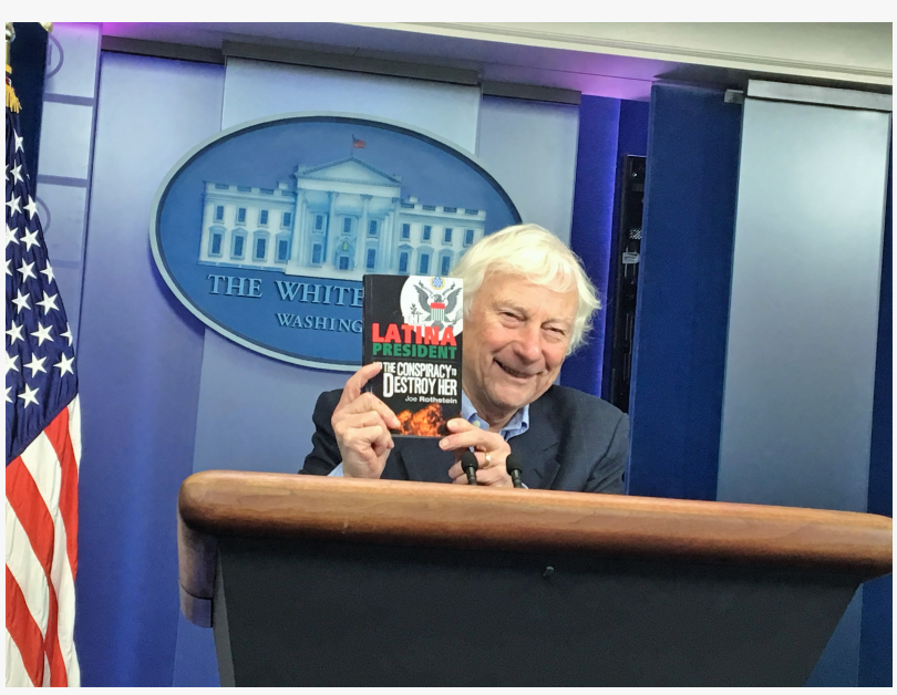
Author Rothstein Discussing Novel In the White House press room