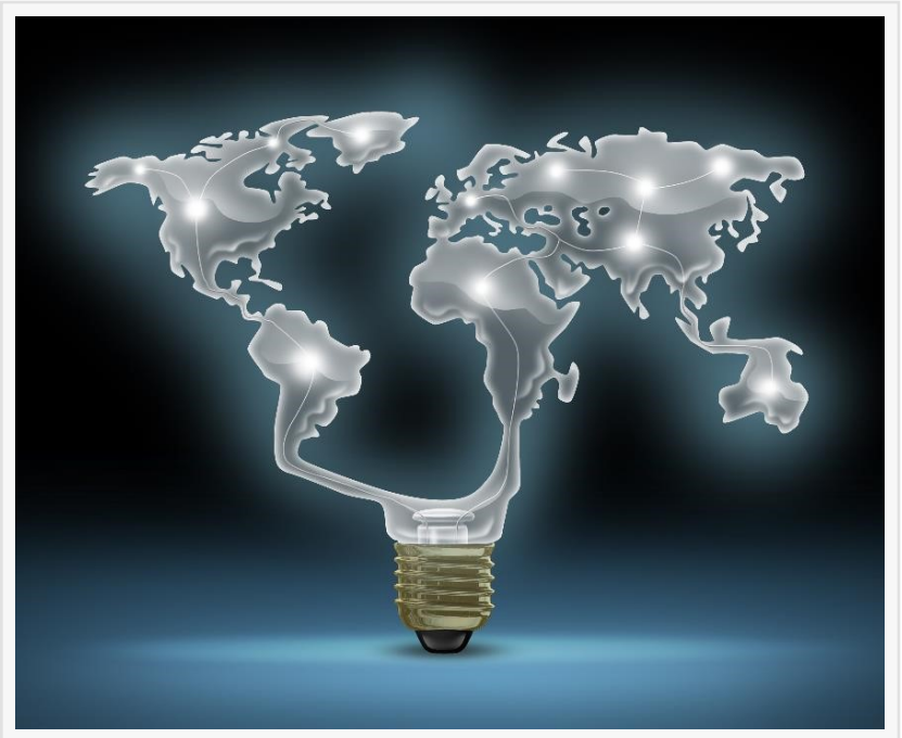
World class innovation - London September 11 2018

Teyneg are all about combining technology and business. They are a leading consultancy and technology