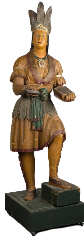
Late 19th century carved and painted Princess Cigar Store Indian, attributed to Thomas Brooks (est. $15,000-$25,000).

Rounding out the sale will be an Asian collection