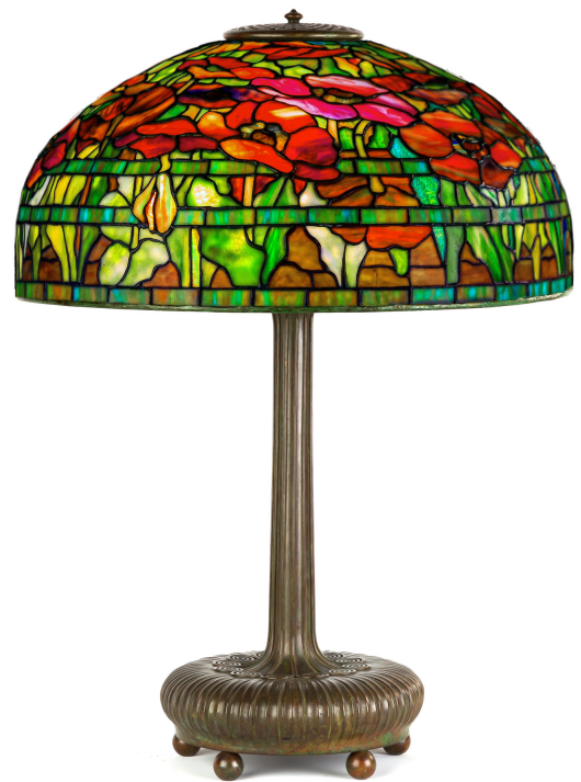
Tiffany Studios (N.Y.) leaded glass and patinated bronze Oriental Poppy table lamp, 25 inches tall (est. $60,000-$80,000)