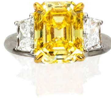
Stunning 5.18-carat emerald-cut, fancy vivid yellow diamond and diamond ring, clarity VS1 (est. $100,000-$150,000).

Matt Cottone Cottone Auctions (585) 243-1000 email us here