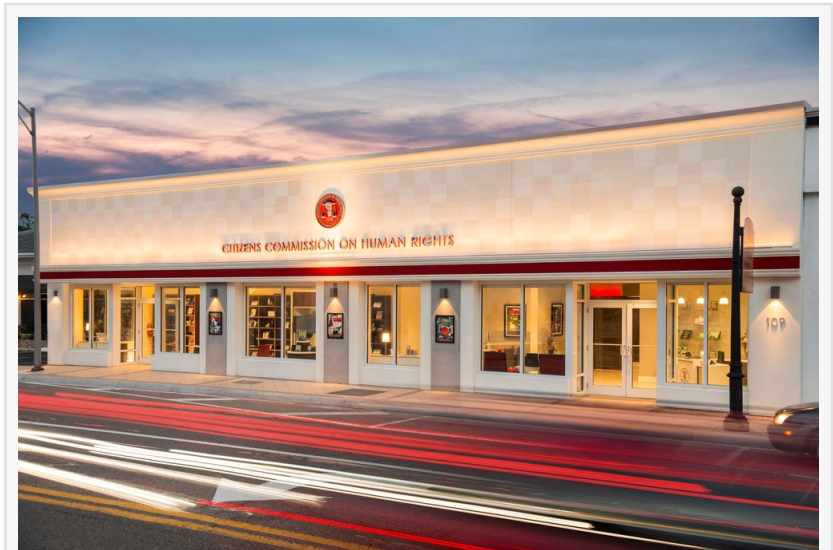
The headquarters for CCHR Florida are located in downtown Clearwater