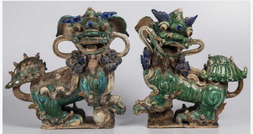
Pair of late 19th/early 20th century Chinese Sancai glaze stoneware Foo Dog roof tile finials.