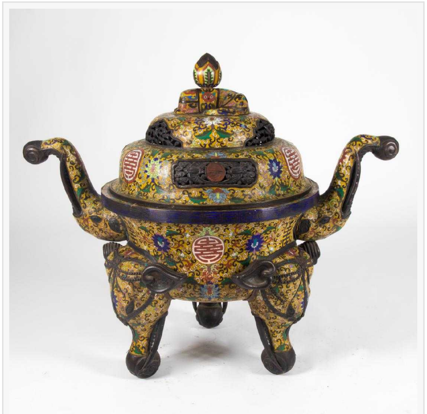
Early 20th century Chinese temple size cloisonné censer, 34 inches tall.

Finely detailed carved wood and stone items are also up for auction, including a carved hard stone landscape depicting figures huddled around a cliff side temple beneath a tree. The detail work and color of this object are exquisite. Lot 238 is a pair of carved elm