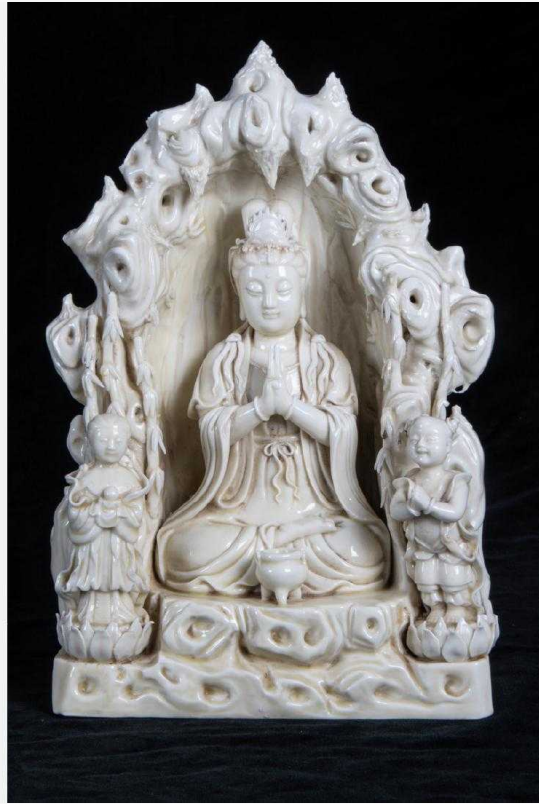
Chinese 19th century porcelain blanc de chine figure of the Guanyin, 13.5 inches tall.

Leading off the auction this month is a wonderful collection of Chinese blanc de chine ceramic figures. Known to the Chinese as Dehua porcelain, blanc de chine porcelain production dates back to the Ming Dynasty and is produced in the town of Dehua, in the Fujian province. First exported to Europe in the early 18th century, these ceramics became internationally renowned for their uniquely pure ivory tone.