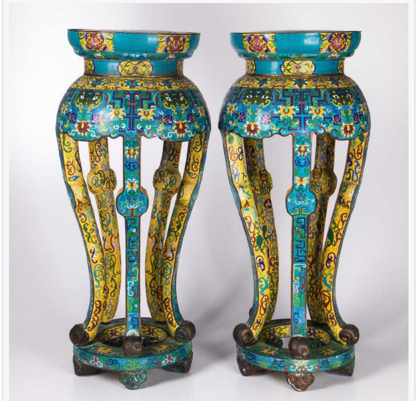
Pair of early 20th century Chinese cloisonné pedestals, 34 inches tall.