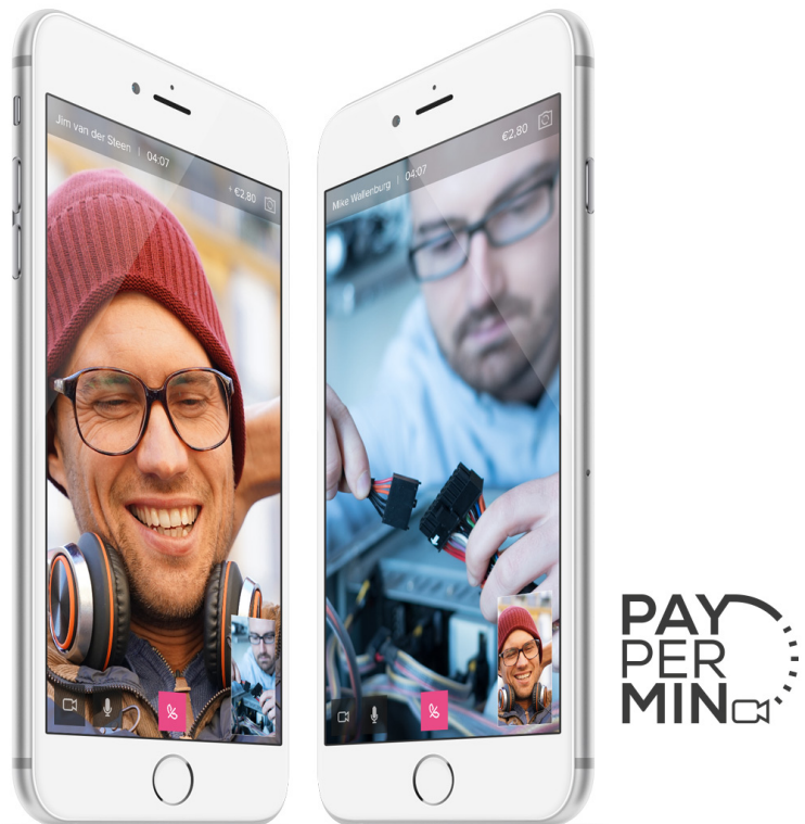
CallTheONE pay per minute