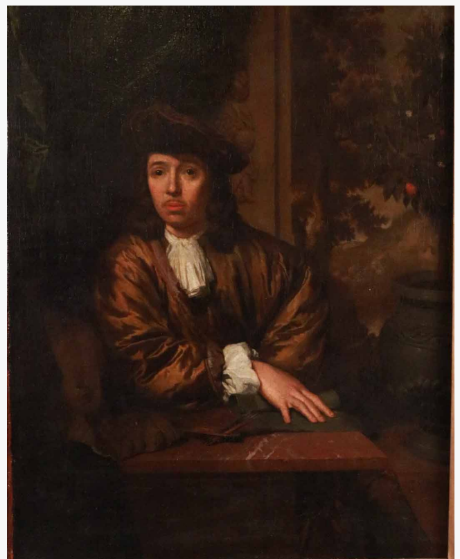
Oil on canvas Portrait of an Artist from the Circle of Caspar Netscher (1639-1684)

The aforementioned work by Helen Frankenthaler (Am., 1928-2011) is certain to attract much bidder interest. It's a color etching and aquatint from an edition of 60, titled A