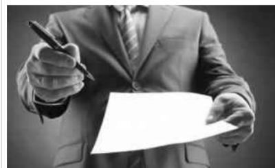
Articles by Curt Surls on CELA VOICE