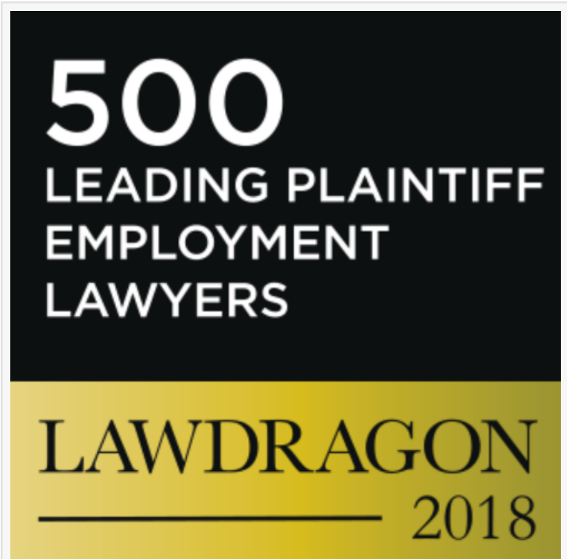
LawDragon 2018, Curt Surls among the 500 leading Employment lawyers

The list of the 500 Leading Plaintiff Employment Lawyers is at http://www.lawdragon.com/2018/08/03/lawdragon-500-leading-plaintiff-employment-lawyers/