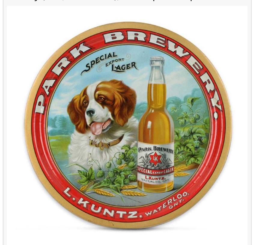
Kuntz 'St. Bernard' tin litho beer tray, made in Waterloo, Ontario and an iconic piece of early Canadian breweriana.

carries an estimate of CA$7,500-$9,500, while the Addams Family machine is expected to