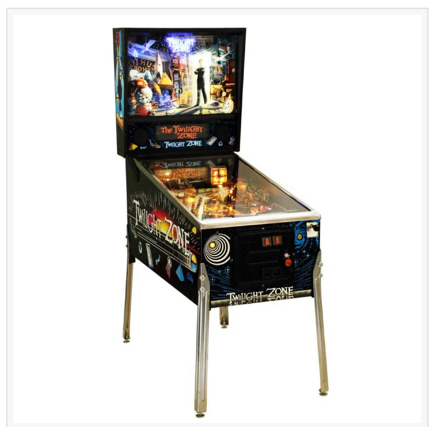
Twilight Zone pinball machine (1993), designed by Bally's pinball wizard Pat Lawlor.

The Saturday event, to be held online and in Miller & Miller's gallery at 59 Webster Street in New Hamburg, Ontario, is bursting with 529 lots of vintage advertising and signs, petroliana (gas station collectibles), breweriana, firearms and knives, coinops, arcade games, vending machines, militaria, barristers' office furniture and vintage cars, motorbikes and outboards.