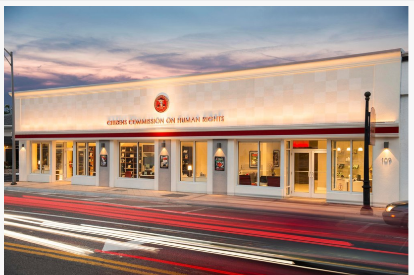
The headquarters for CCHR Florida are located in downtown Clearwater