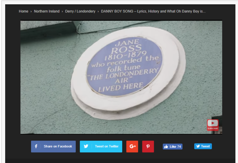
Danny Boy plaque in Northern Ireland

“The great news is that people from across the world taking an interest in Limavady also means they browse around our site and other sites to find out more about the wider area and