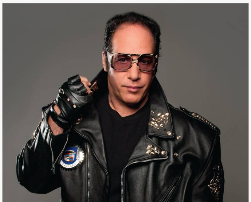
The Dice Man Commeth with podcast "I'm Ova Hea' Now"

If you're still not sure about subscribing, you get a free 14-day trial with that bonus code, and if