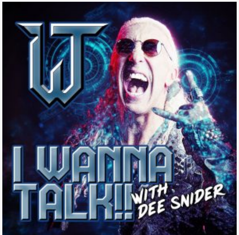
Dee Snider Joins GaS Digital with "I Wanna Talk"