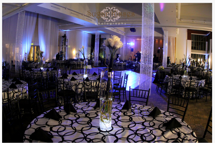
Wedding Reception Draping and More

BeDazzle My Events has everything in inventory for their clients need to come up with the perfect decor for their event, as well as expert event planners in Los Angeles. From chiavari chairs, tents, furniture, draping's and more, their mission is to make sure that their clients event is a huge and fabulous success. By offering party rental services in Los Angeles California, BeDazzle My Events will now ensure that their client base in the the local area can have thousands of party rental items at their disposal for whatever kind of event they need to plan for.