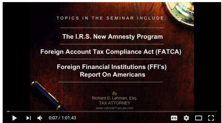
New IRS Amnesty, FATCA & FFI Reporting