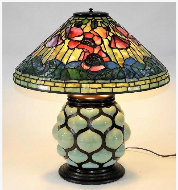
Tiffany Studios blown glass table lamp with 20 inch diameter Poppy shade of multi-colored Favrite glass (est. $80,000-$120,000).