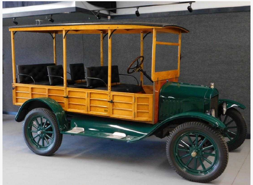
Restored 1922 Ford Model T wood body depot hack truck, with inline 4-cylinder engine (est. $8,000-$12,000).