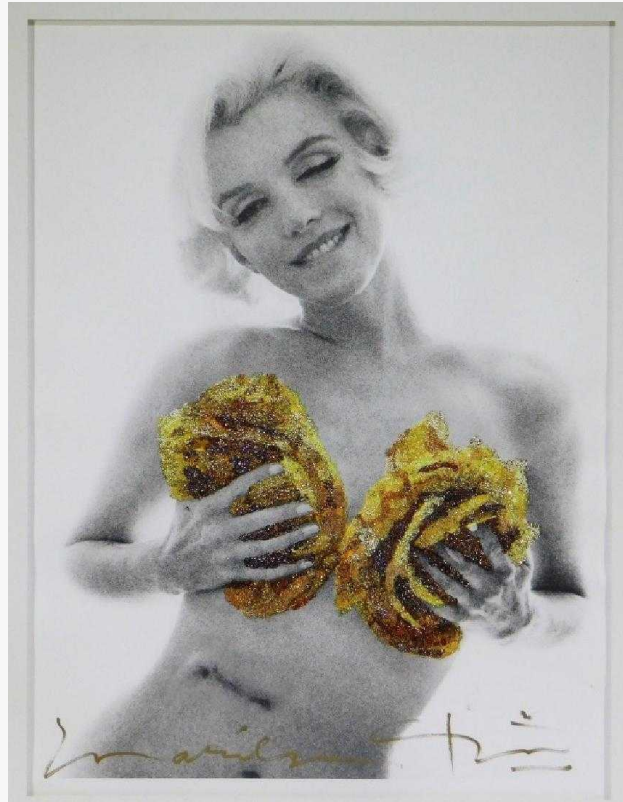
Hand-colored lithograph titled Marilyn with Gold Roses (The Scar), taken by photographer Bert Stern (est. $3,000-$5,000).