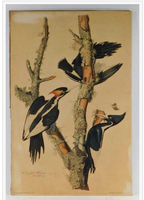
Original hand-etching by John James Audubon (1785-1851), titled Ivory-Billed Woodpeckers (est. $6,000-$9,000).

This press release can be viewed online at: http://www.einpresswire.com