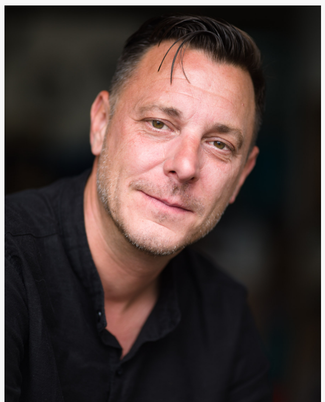
Author: Paul Thorn

Furin continues; “There is, however, an alternative TB strategy that could finally turn the tide against this age-old scourge: a human-rights based approach to the disease. Paul provides a blueprint for such an approach in his diary, which stresses the significance of each person’s unique journey with TB. A human rights-based approach to TB means putting the person with TB at the center of all activities and striving to achieve the best possible outcome for every single man, woman, and child who is affected by the disease. It means that all people with TB - regardless of their geographic location or perceived level in society - have a right to the most sensitive diagnostic tests, to be treated with the most effective medicines, to be provided all the means to prevent the development of TB, and to receive care in a way that allows them to live dignified and productive lives. It does not view the provision of such services as extravagant extras, but rather as the fundamental rights of every person to life and health.