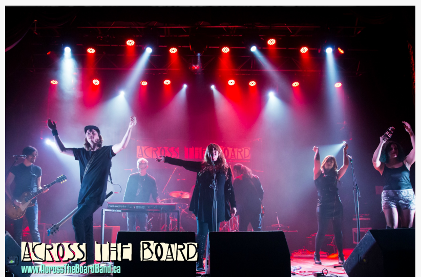
Across The Board