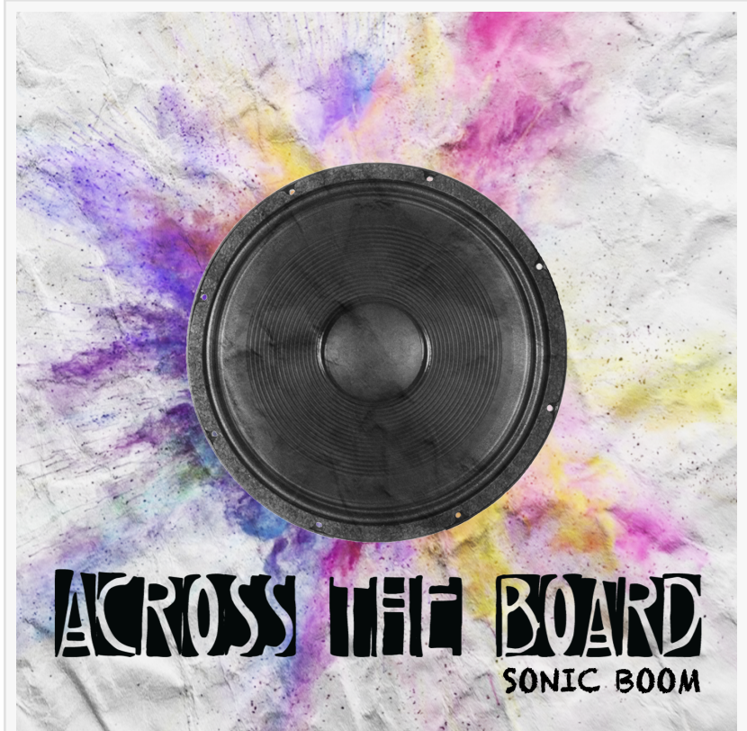
The title track "Sonic Boom" hits #4 on iTunes Canada Rock chart