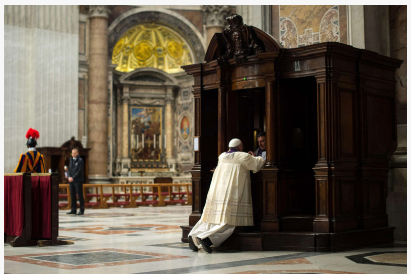
Confession at the Vatican