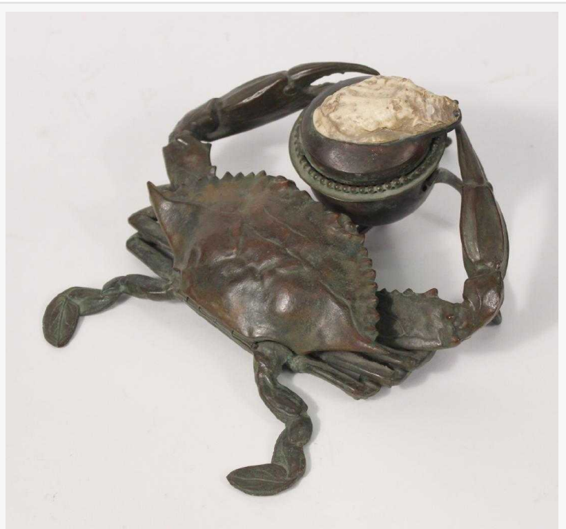
Tiffany Studios cast bronze crab inkwell with an oyster shell lid, stamped and numbered (est. $5,000-$10,000).

John Nye Nye & Company Auctioneers (973) 984-6900 email us here