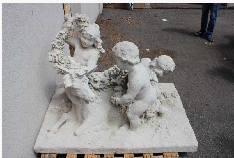
Pair of limestone figural groups, one signed by H. (Henri Leon) Greber (Fl., 19th/20th c.) (est. $8,000-$12,000).

An Italian carved marble well head, circa the 19th century, 37 inches tall by 30 inches wide, has an estimate of $7,000-$10,000. Also, a Tiffany Studios cast bronze crab inkwell with an oyster