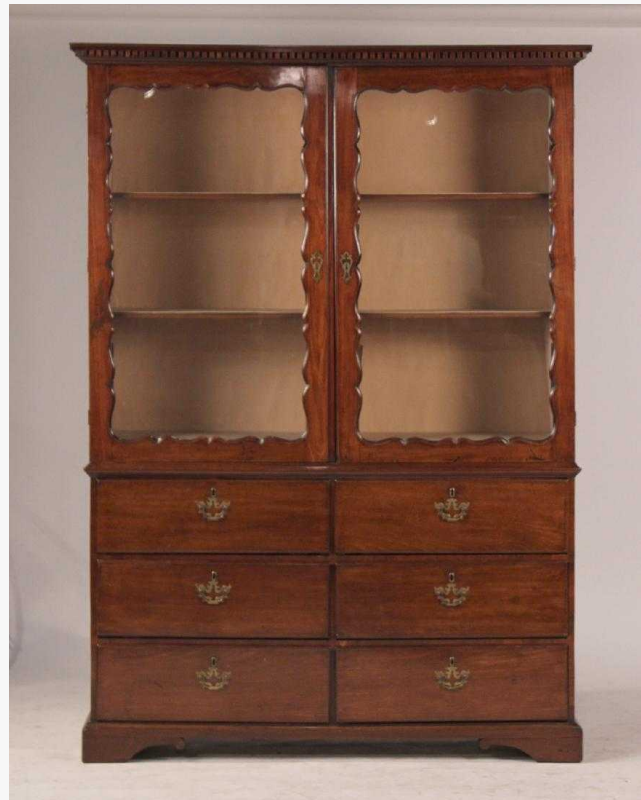
Mid-18th century English George II mahogany wall cabinet in two parts, 6 feet 8 inches tall (est. $1,500-$3,000).