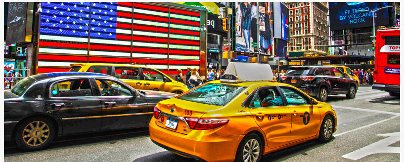
TLC Car Rental to Improve Uber Pings and Lyft Requests

Finally, you can increase your chances even more by selecting areas of the city that offer two or