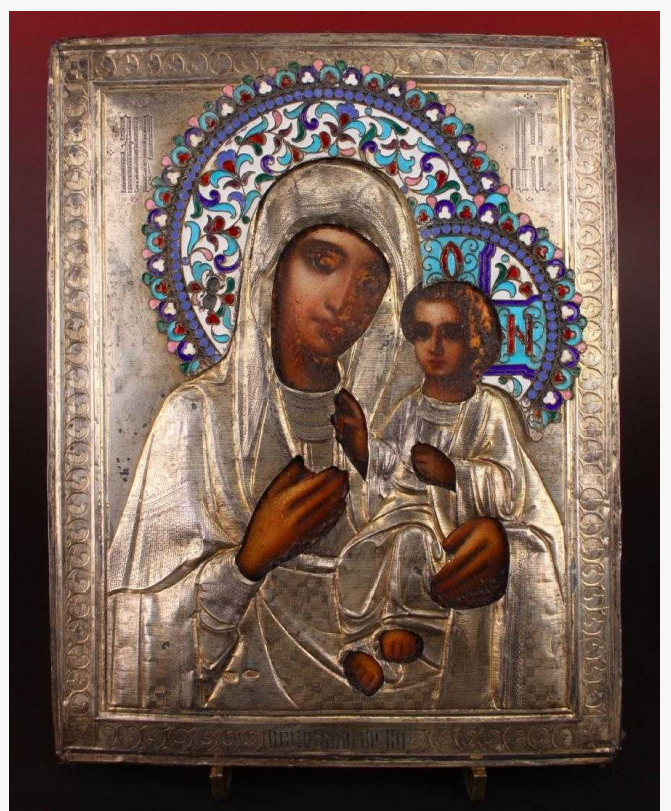
Russian religious icon depicting Madonna and Child, displayed in a repoussé silver frame (est. $300-$500).

A Seth Thomas double-dial calendar regulator shelf clock in a mahogany veneer, 42 ½ inches tall by 18 inches wide, with Roman numerals on the top dial, two keys, a pendulum bob and weight, is estimated at $3,000-$5,000. Also, a