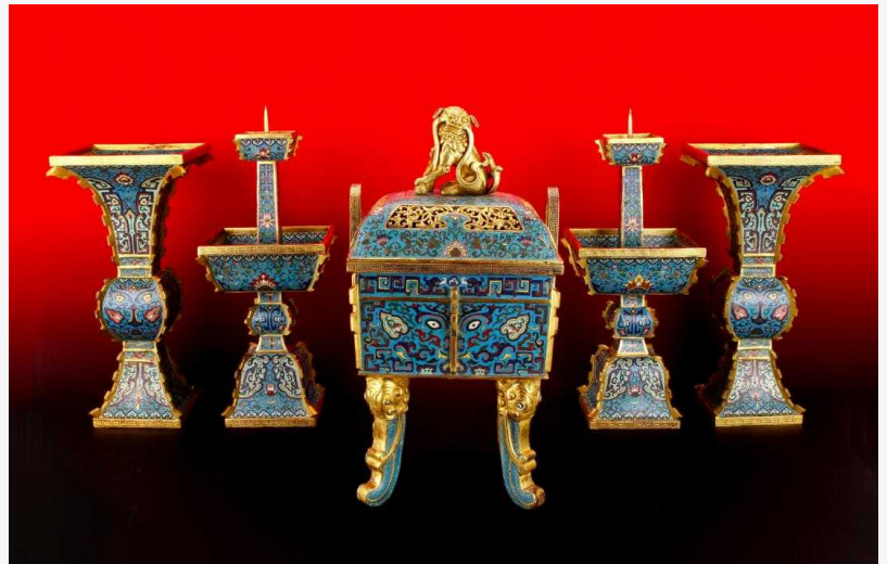
Magnificent Chinese Qianlong cloisonne altar set, with a central censer, pair of vases and pair of candlesticks (est. $20,000-$40,000).