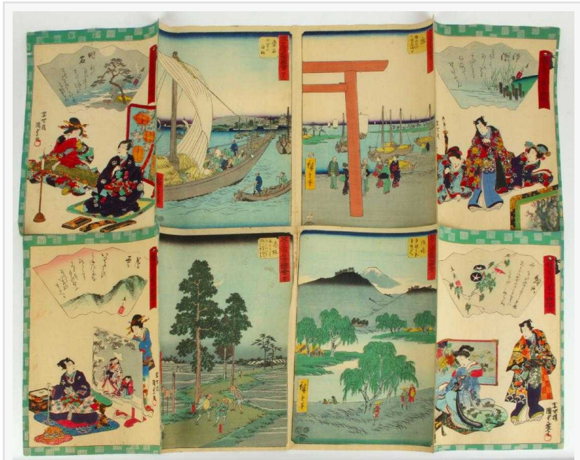
Unbound book of Japanese woodblock accordion prints in uncut sheets, 110 in all, by Hiroshige and Kunisada (est. $20,000-$40,000).

The West category features furniture, fine art, fine clocks and jewelry, decorative items, sterling silver, Russian icons , World War II uniforms and medals, and African tribal artifacts . The East category boasts fine Japanese woodblock prints , Chinese furniture, cloisonné, porcelain, plaques, fine paintings, sterling silver, 14kt and jade jewelry, brushpots, lacquer and musical instruments.