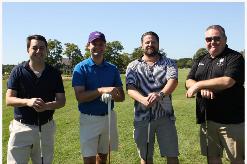
Golfing for Cyber Safety Awareness