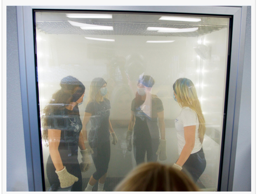
4 people treated at same time

outcomes, and convenience using whole body walk-in systems. US Cryotherapy has become a global leader in WBC having administered over 1-million treatments since 2011 with exceptional safety, service, and customer experience reviews. US Cryotherapy contract manufactures its proprietary equipment in the US and directly sells equipment to various independent medical groups, sports teams, NCAA, and for home use as well. US Cryotherapy is owned and operated by the Kramer family. US Cryotherapy's Corporate Offices are located at 1490 Drew Ave, Suite 110 Davis, CA 95618. # 866-279-2796 <a href="https://www.uscryotherapy.com">www.uscryotherapy.com</a> For more information.