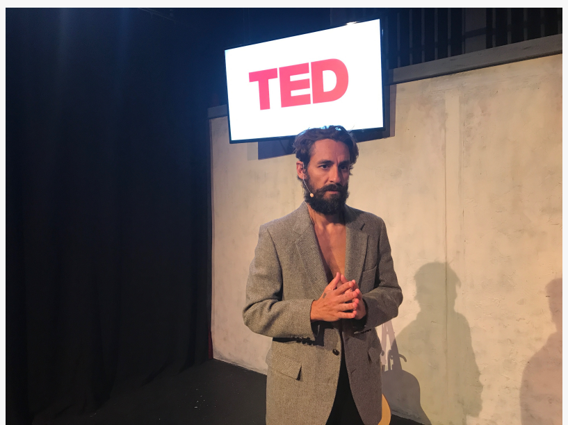
I AM CHARLIE @ Promenade Playhouse