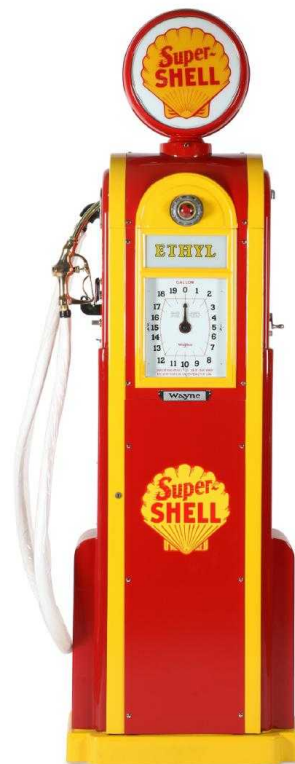
Bright and colorful Super-Shell Wayne 60-inch Art Deco clock face gas pump, beautifully restored (CA$6,037).