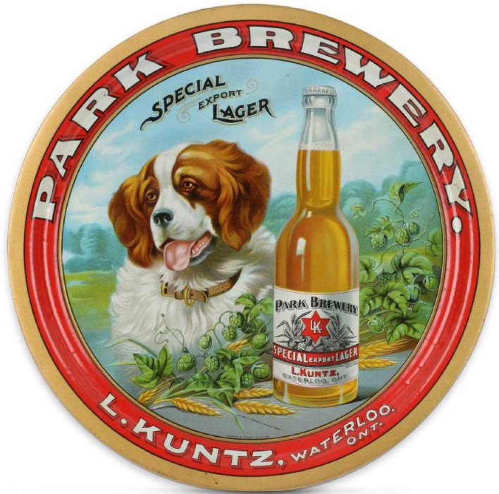
20th century Kuntz 'St. Bernard' tin litho beer tray, an iconic piece of early Canadian breweriana (CA$5,463).

A bright and colorful Super-Shell Wayne 60-inch Art Deco clock face gas pump (U.S., circa 1930s), a pump that's had an exceptional restoration throughout, changed hands for CA$6,037; while the aforementioned Buffalo Motor Oil half-gallon tin (Canadian, circa 1920s), with the original cap and spout and among the finest examples known, knocked down for