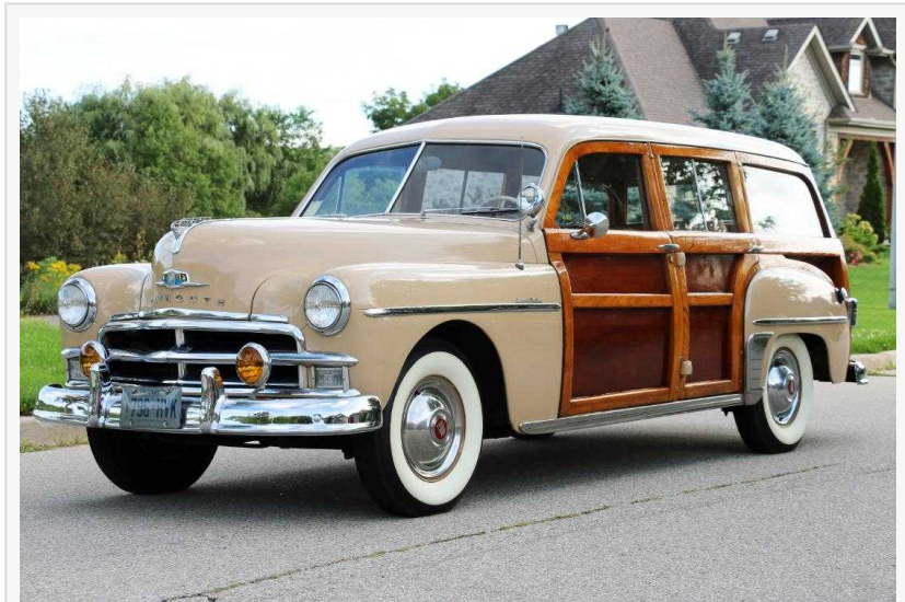
1950 Plymouth Special Deluxe woody station wagon, all original and nicely restored (CA$35,400).

NEW HAMBURG, ONTARIO, CANADA, September 24, 2018 / EINPresswire.com/ -- NEW HAMBURG, Ontario, Canada – Men, and the women who love them, turned out in full force September 15th for Miller & Miller Auctions, Ltd.'s Mantiques! Gentleman's Collectibles auction, held online and in Miller & Miller's gallery at 59 Webster Street in New Hamburg. The auction was a one-stop shop for anyone looking to equip their man caves in style and fashion.