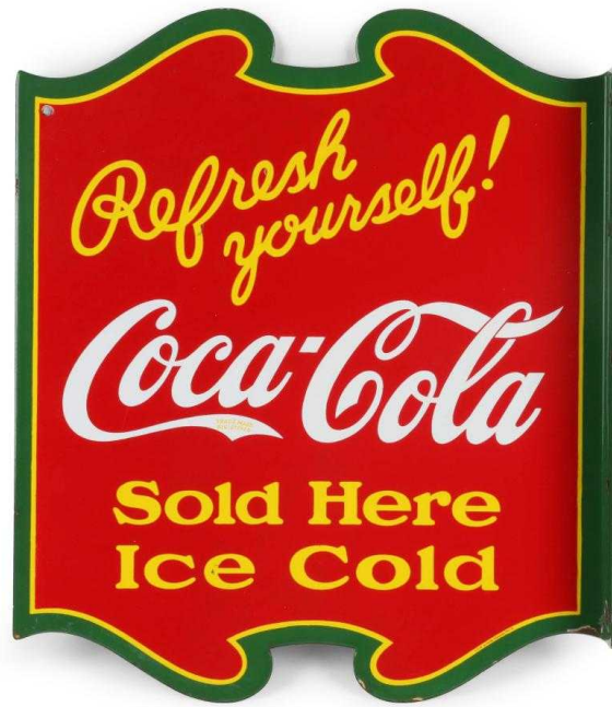
1950s-era Coca-Cola porcelain flange sign made for the Canadian market, in near-perfect condition (CA$5,015).

To consign a single piece, an estate or a collection, you may call them at (519) 573-3710 or (519) 716-5606; or, you can send an e-mail to info@millerandmillerauctions.com . To learn more about Miller & Miller Auctions and their upcoming auctions, visit www.MillerandMillerAuctions.com .