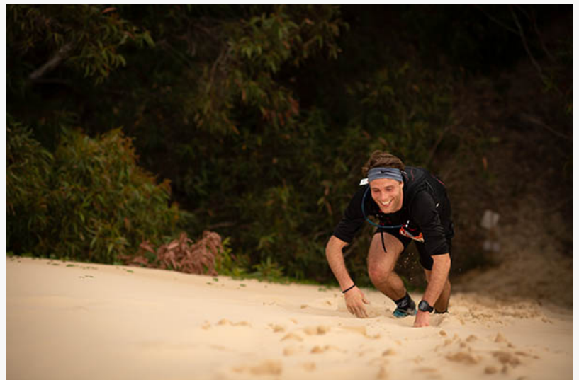
Tomaree Trail Run The Wall