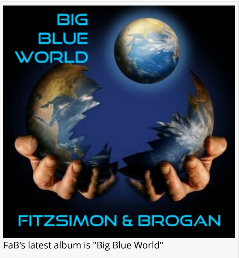
FaB's latest album is "Big Blue World"