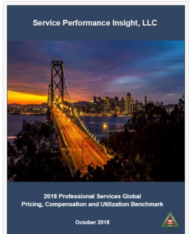
2018 PS Pricing, Compensation and Utilization Benchmark

This is one of the largest and most comprehensive PS pricing studies ever published based on pricing information provided by 156 organizations representing over 11,000 consultants worldwide. The independent study profiles published and realized bill rates, base and variable compensation, billable utilization and target annual revenue across 12 job roles. It provides an unprecedented view of Professional Service workforce distribution and composition by industry segment through an analysis of organization structures for various service segments including Advertising, Media and Publishing; Architects and Engineers; Management Consulting; IT Consulting and Software and SaaS technology services.