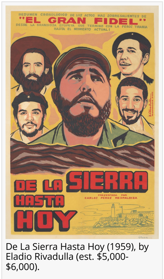
De La Sierra Hasta Hoy (1959), by Eladio Rivadulla (est. $5,000-$6,000).

This press release can be viewed online at: http://www.einpresswire.com