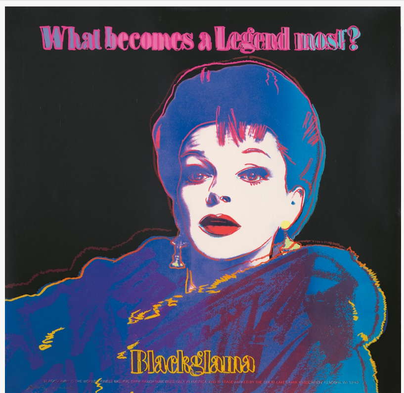
Blackglama / Judy Garland (1985), by Andy Warhol (est. $30,000-$35,000).