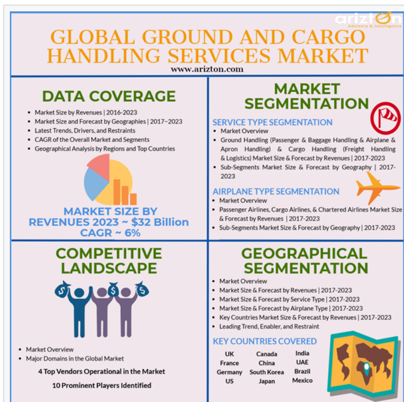
Ground and Cargo Handling Services Market 2023

The ground handling services market is estimated to generate revenues of around $32 billion by 2023, growing at a CAGR of approximately 6% during 2017-2023.