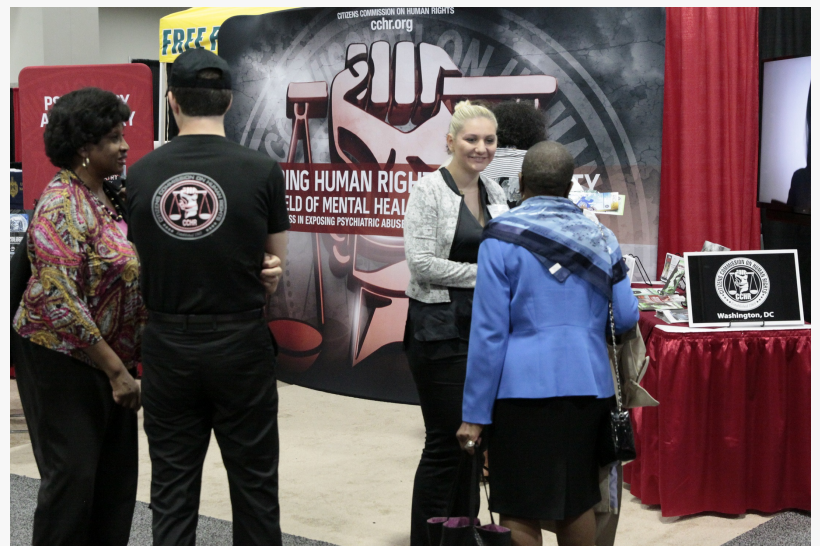
Participants are briefed on their rights in the mental health system by Citizens Commission on Human Rights Volunteers at the Congressional Black Caucus Foundation’s 48th Annual Legislative Conference