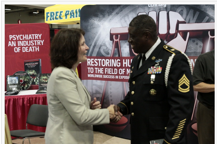
A veteran is welcomed to the Citizens Commission on Human Rights display and learns about issues affecting veterans’ mental health at the Congressional Black Caucus Foundation’s 48th Annual Legislative Conference

Citizens Commission on Human Rights is a nonprofit charitable mental health watchdog