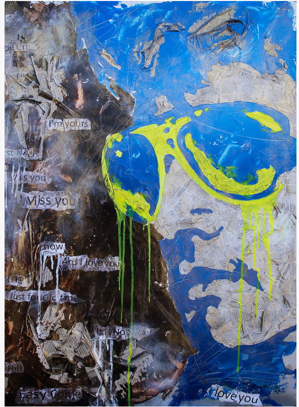
"Blue mood 2" - Iness Kaplun

Michael Ezra International Art Fair (917) 449-2842 email us here