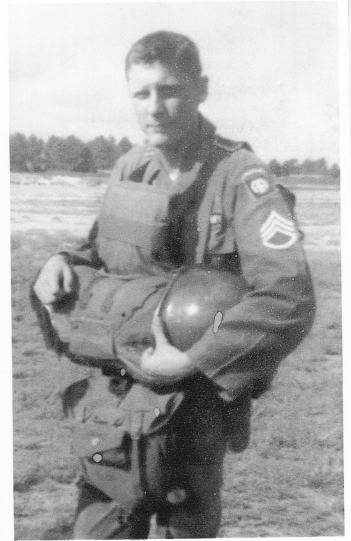
Author in the early days