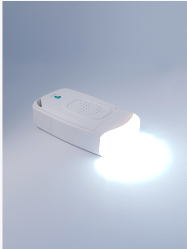
WanderSafe comes in two colors Ivory and Onyx