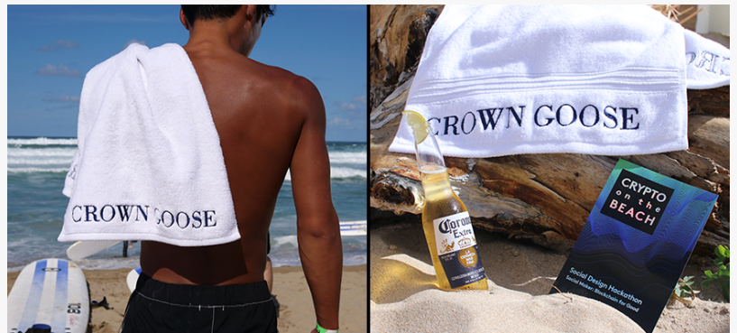
Participants were able to experience surfing culture and received a hotel bath collection towel from Crown Goose.

This press release can be viewed online at: http://www.einpresswire.com