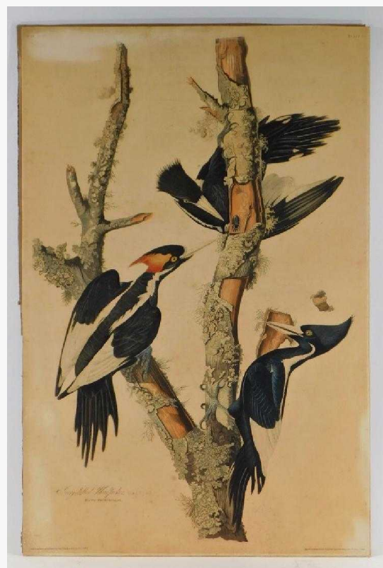
Original hand-colored etching of Ivory-Billed Woodpeckers by John James Audubon (1785-1851) ($46,250).