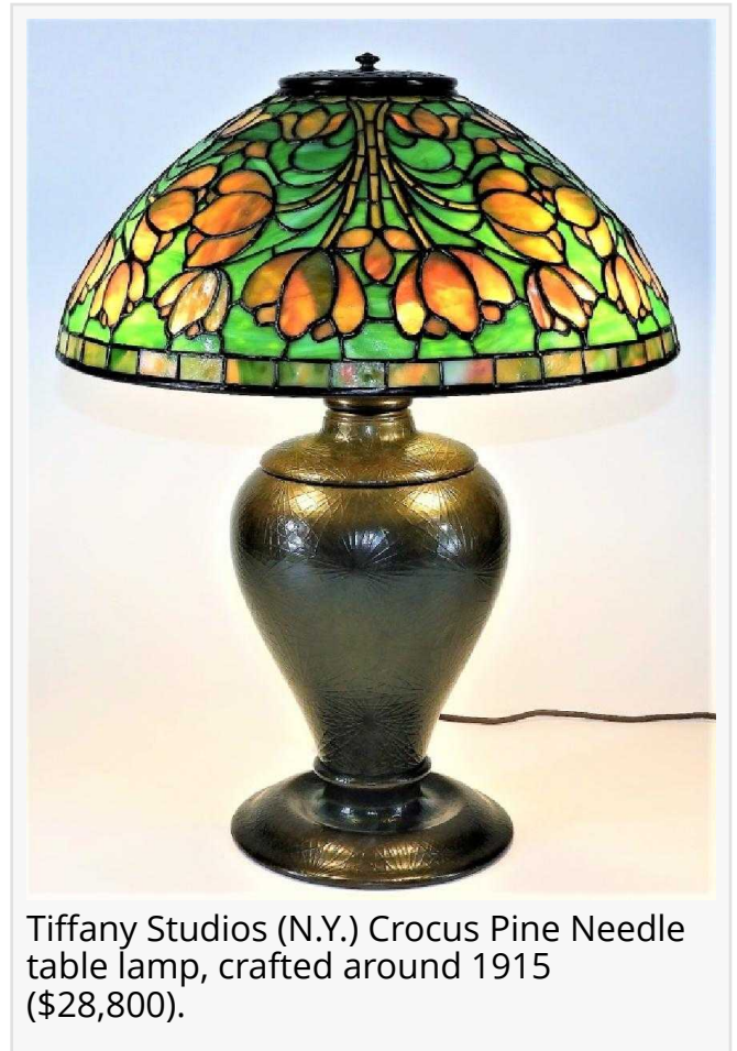
Tiffany Studios (N.Y.) Crocus Pine Needle table lamp, crafted around 1915 ($28,800).

This press release can be viewed online at: http://www.einpresswire.com