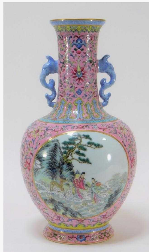
Chinese Qing Dynasty baluster form pink ground Yangcai famille rose vase ($15,000).

Travis Landry Bruneau & Co. Auctioneers 4015339980 email us here