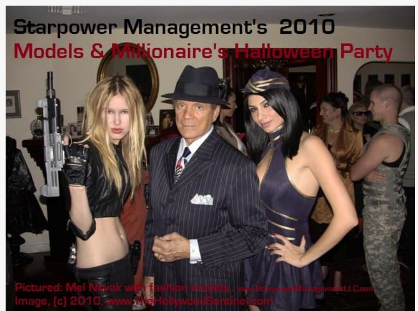
Starpower Management Party with actor Mel Novak and Fashion Models