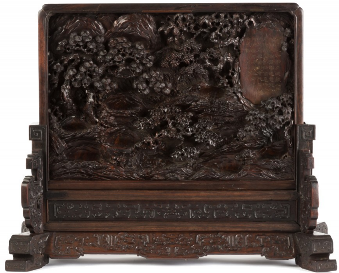
Chinese Qing Dynasty carved hardwood scholar table screen, with an Imperial poem signed by Dong Gao ($155,760).