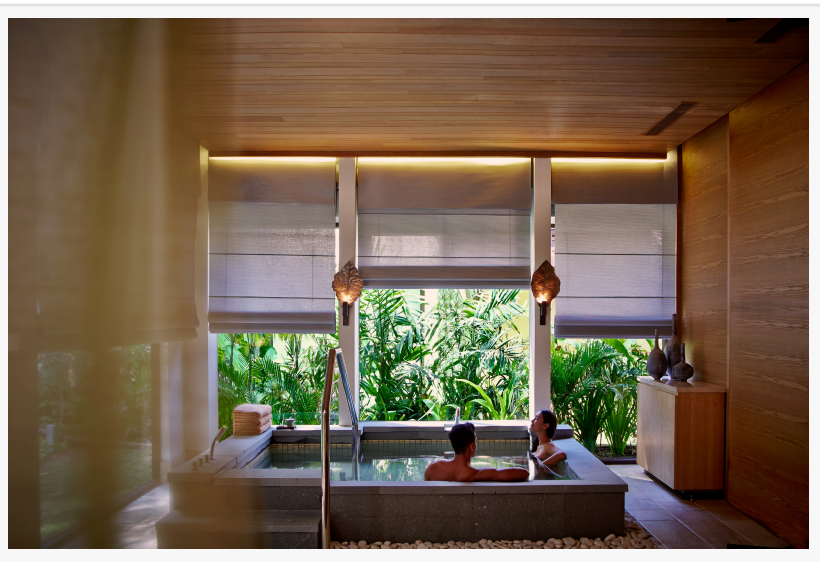
A fabulous array of spa and beauty treatments for couples

Those with an intimate ceremony in mind can elevate their ceremony, literally, with an exclusive <u>Sky Wedding</u>, An inspired option for up to eight guests, our fabulously-appointed Sky <u>Villas</u> have a top floor location and exquisite panorama, so you can exchange vows with bird's eye views over the sparkling Indian Ocean.