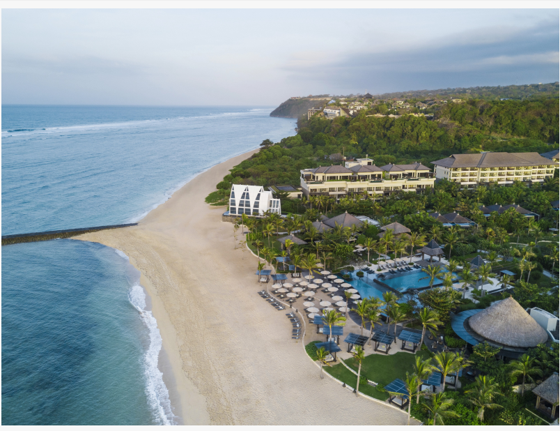
Exchange vows with bird's eye views over the sparkling Indian Ocean.