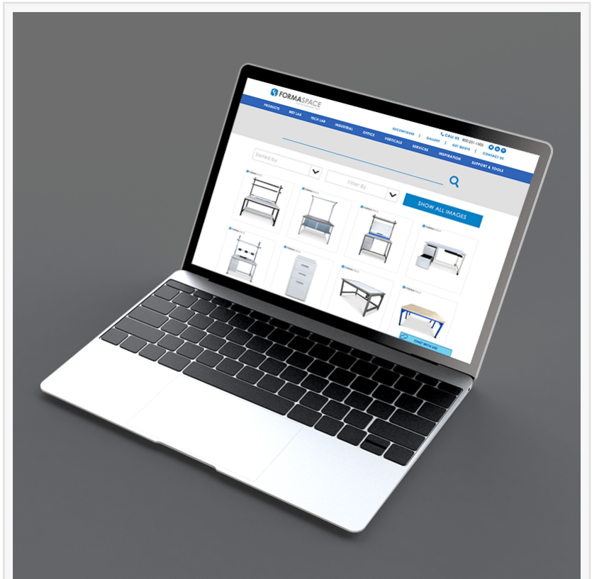
Formaspace new gallery page

Brooke Turner Formaspace 8002511505 email us here