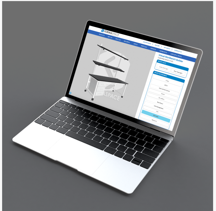
Formaspace 3d configure update

This press release can be viewed online at: http://www.einpresswire.com