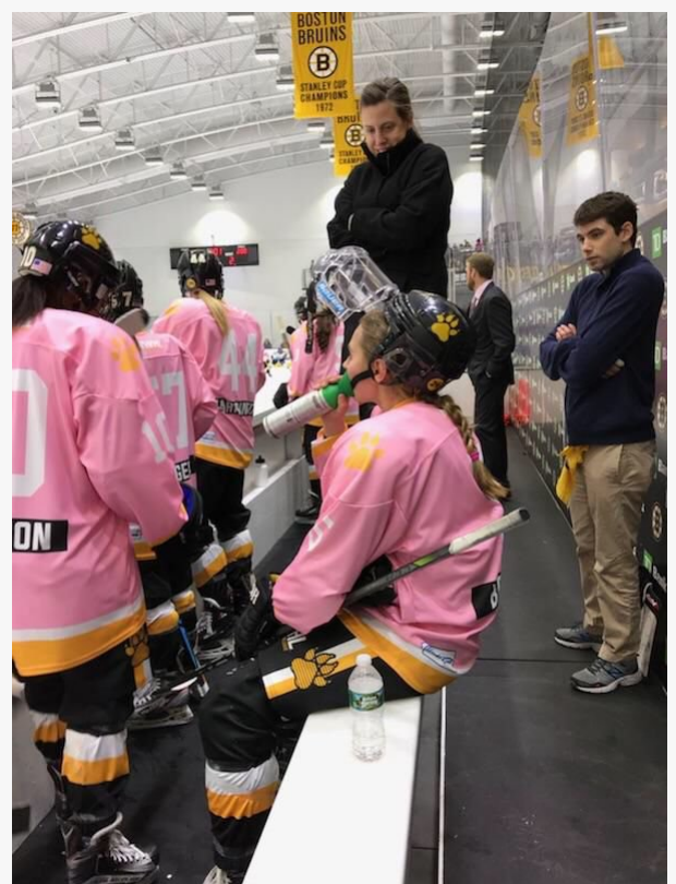
Players support their performance with Boost Oxygen