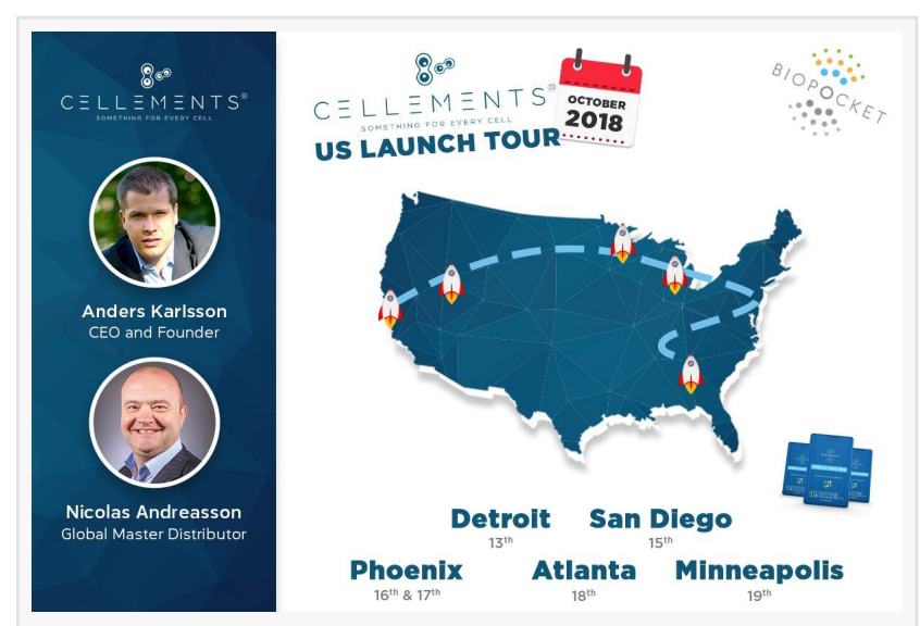
US Cellements Launch Tour

the BioPocket line of products that revolutionized Europe.