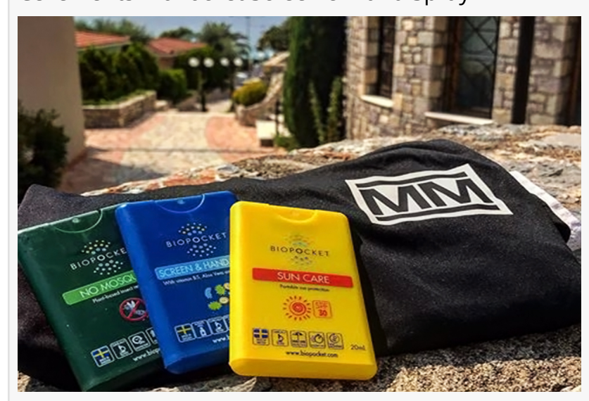
Cellements BioPocket Products

This press release can be viewed online at: http://www.einpresswire.com