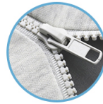
Removable pillow case