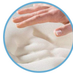
90D high-quality memory foam